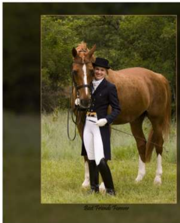
Bad Friends Forever